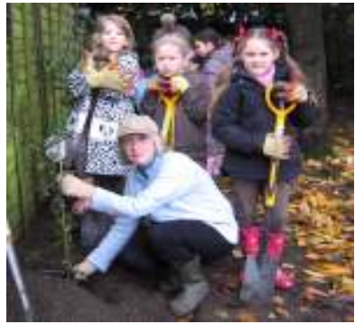
Planting Tudor Lodge corner

Another Ward Fund grant project is the ongoing work at the little green by Tudor Lodge Hotel. The Guides and Brownies from St Lawrence Church helped the EHG volunteer gardeners clear the area and plant daffodils and shrubs, yet again on a cold, wet and windy day. A seat and pathway will be installed soon.